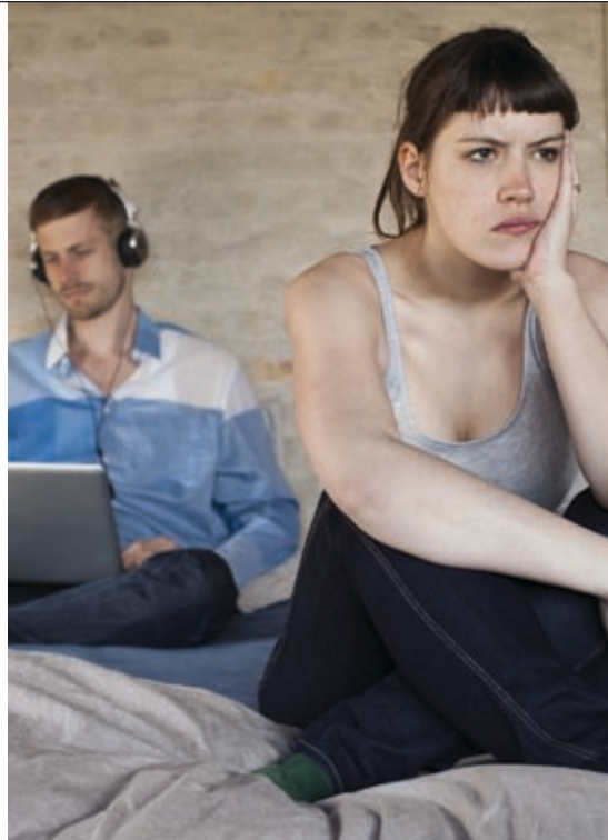
Psychodynamic therapists identify recurring relationship themes and patterns. For example, a woman who felt ignored as a child ( far left ) may find herself having similar feelings in adulthood ( left ). Psychodynamic therapy can help free her from old patterns.

and interactions. The relationship between therapist and patient—what therapists call the “working alliance”—is critical to success.